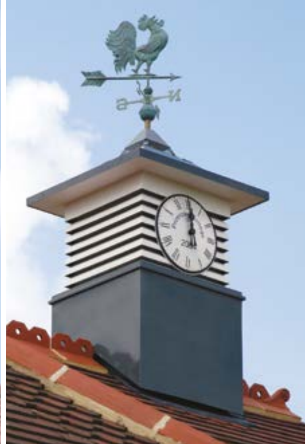
Natural Ventilation by Monodraught