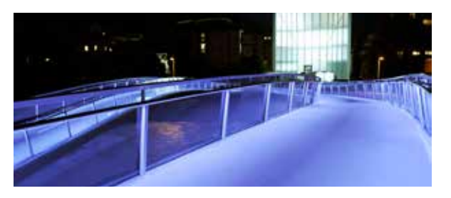
New Modern Art Museum (Bolzano, Italy)

Considered to be the world's most luxurious hotel, its stunning sail shape is internationally recognisable. Guests and staff across its 56 floors and 202 rooms can be reassured by a combination of 4,500+ luminaires and 130 emergency lighting panels.