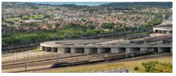
Eurotunnel (Folkestone, UK / Calais, France)

Schiphol is the third busiest airport in Europe, serving over 63 million passengers a year. The airport includes 3 departure halls, 8 concourses and 142 gates leading to 6 runways. Approximately 30 Eaton Euro ZB and ZB-S central battery systems and 3,000 bespoke luminaires for emergency lighting are in use throughout the airport.