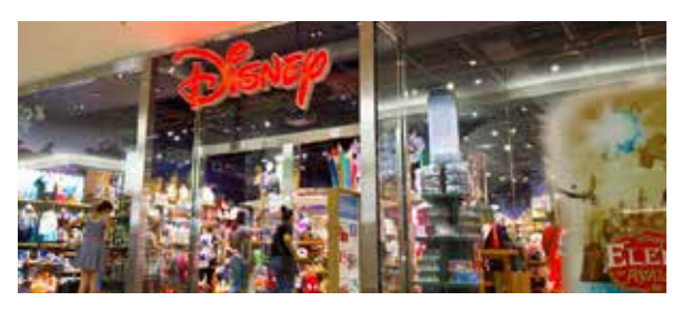
Disney Stores (United Kingdom)

A range of Eaton fire systems can be seen in the biggest names in retail throughout the UK. Many Apple stores in the country's largest shopping complexes are fitted with Eaton fire systems.