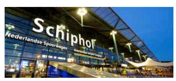
Schiphol Airport (Amsterdam, Netherlands)

Bangkok airport is one of Asia's busiest airports, handling in excess of 50 million passengers every year. 60+CG2000 group battery systems and nearly 2,000 luminaires help meet the complex safety challenges of the site.