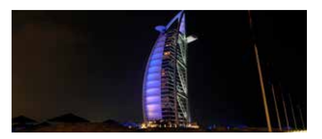
Burj Al Arab (Dubai, United Arab Emirates)

The developers behind the largest trampoline park in Wales, UK chose Eaton for Fire, Emergency and Mains lighting systems. The 120 trampolines, 6 foam pits and dodgeball arena are protected by a BiWire Ultra fire system alongside high performing Alfalux Highbay LED emergency luminaires.