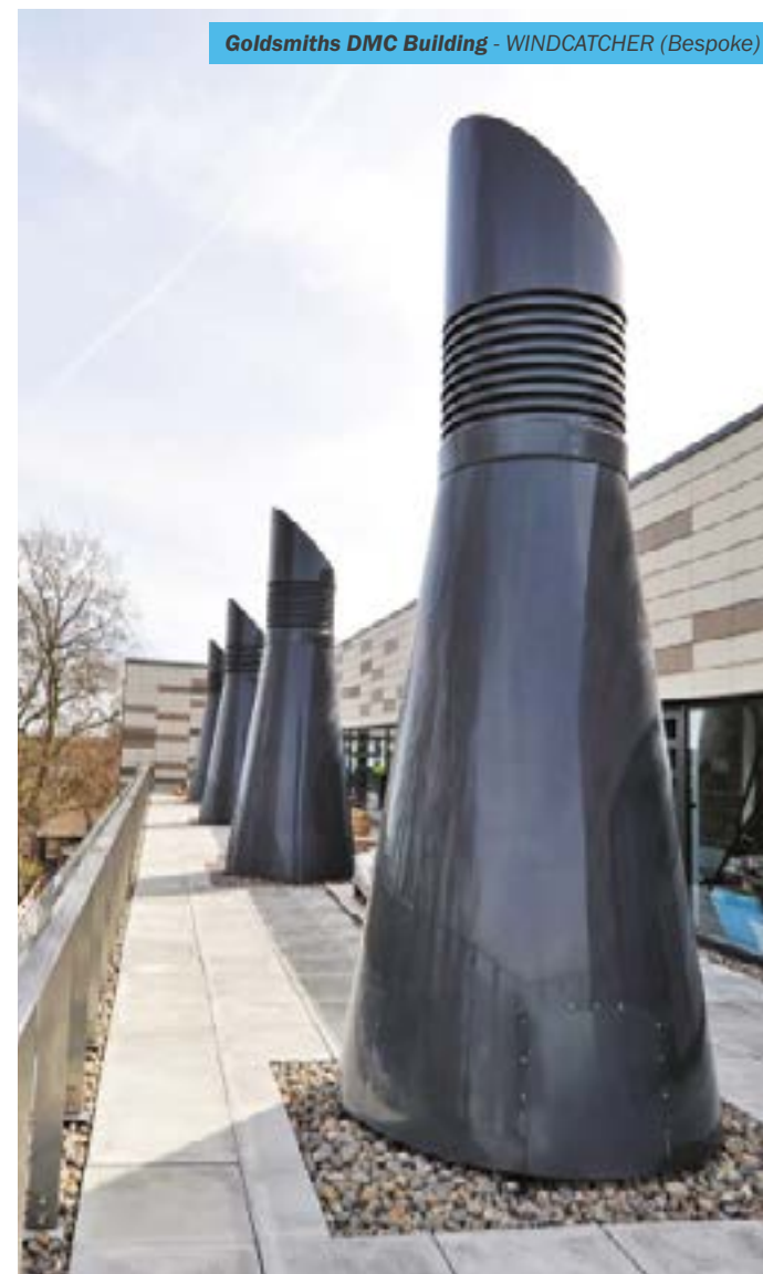
Goldsmiths DMC Building - WINDCATCHER (Bespoke)