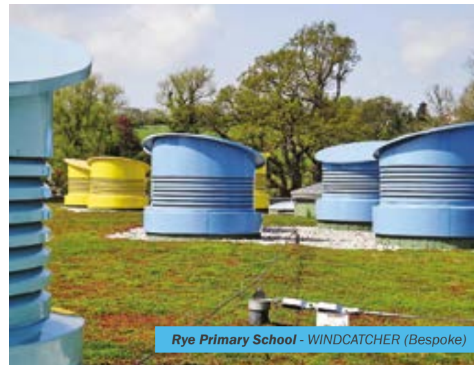
Rye Primary School - WINDCATCHER (Bespoke)