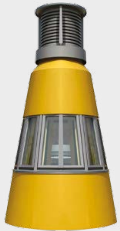
Natural Ventilation by Monodraught