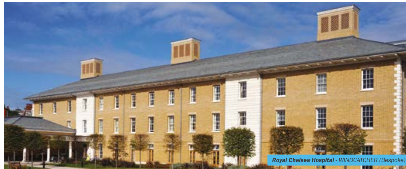
Royal Chelsea Hospital - WINDCATCHER (Bespoke)