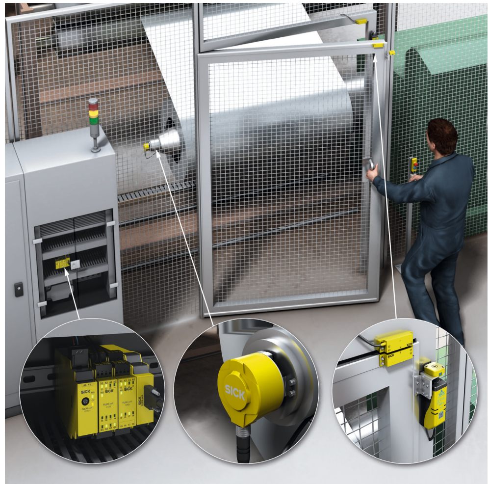
Figure 1: Overview of Safe Interlocking

If the machine stops, unexpected restart is prevented. Not until access to the hazardous area is closed and locked and the machine has been reset can the machine be restarted. An emergency switching off function is also integrated.